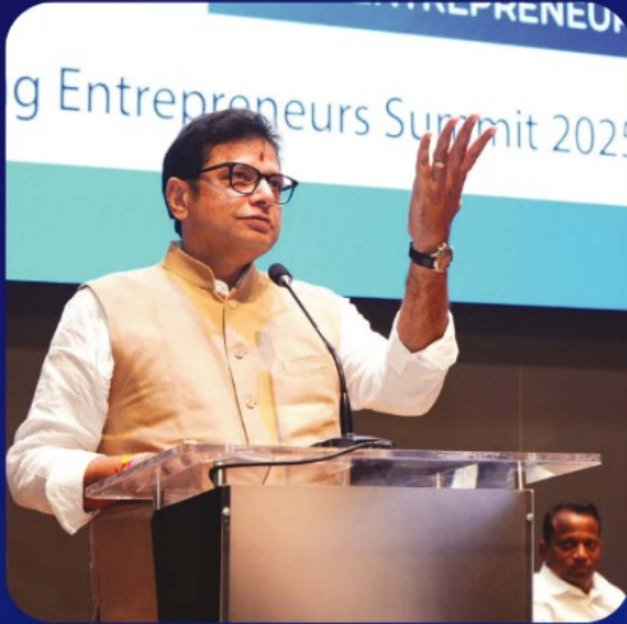
Shri Duddilla Sridhar Babu garu Hon'ble IT & Industries Minister